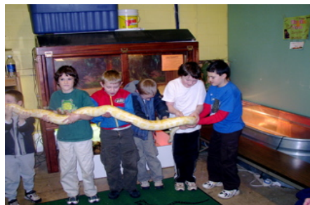
Boys' social group enjoying an outing to Zany Zoo.

For more information, please contact bridgewayhouse@comcast.net . Thank you.